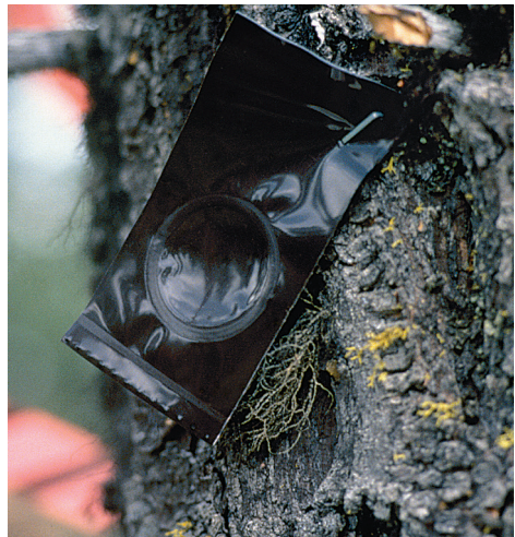
Figure 3. MCH bubble capsule stapled to a tree.

Bubble capsules are applied by stapling or otherwise attaching them to trees, snags, shrubs, fence posts or any other object (Fig. 3). They are usually applied at a height that applicators can easily reach (i.e., 6-8 feet), but they can be placed higher in areas such as campgrounds or residential sites where it is likely that they may be disturbed. Ladders or a special long-handled hammer, known as a Hundle hammer, can be used to attach bubble capsules at a height where they are beyond reach.