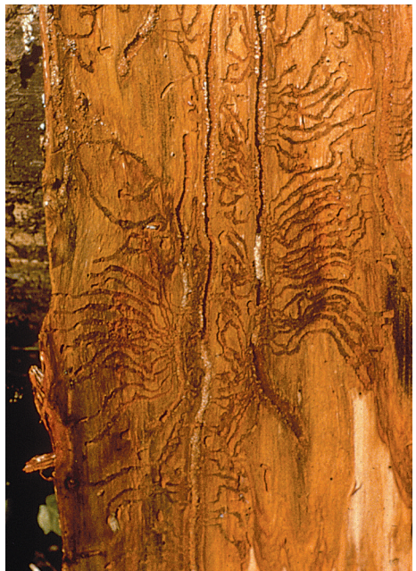
Figure 2. Characteristic pattern of Douglas-fir beetle egg and larval tunnels.