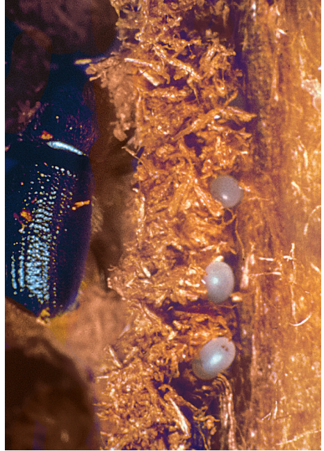
Figure 1. Adult Douglas-fir beetle and eggs in gallery. Actual size of the adult is 4.5 - 7.0 mm (about \frac{3}{16} - \frac{1}{4} inch) long.